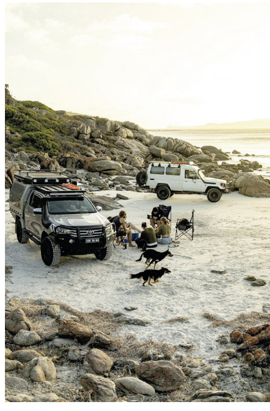
• Fishing on the south coast.

"The establishment of a marine park along the south coast must be balanced and should