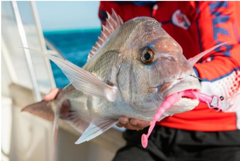
WA pink snapper.

LAST week the McGowan government released a discussion paper proposal that could see recreational fishers banned from fishing for the state's iconic dhufish and pink snapper species for up to nine months of the year, while commercial fishing continues year round.